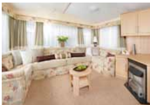
Choice of accommodation