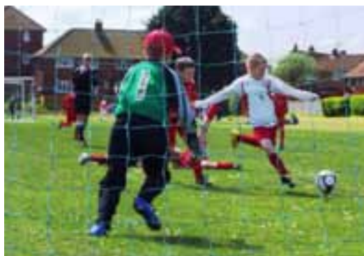
Fantastic football organisation