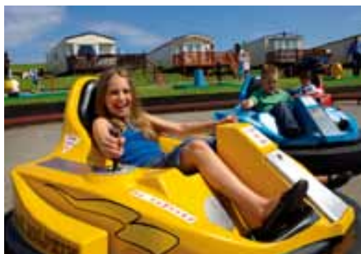
Holiday park fun

New for 2010 we are offering all teams an easy payment option with £50 monthly payments per Caravan from September to March and any final payment April.